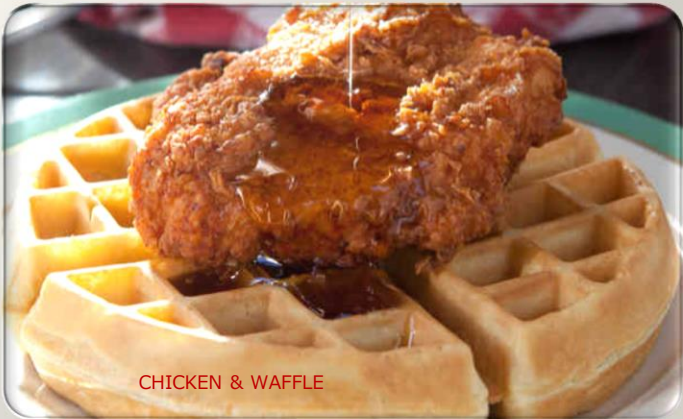
CHICKEN & WAFFLE

Stuffed with bacon, sausage, ham, and cheese. Served with two eggs, butter and syrup 10.99