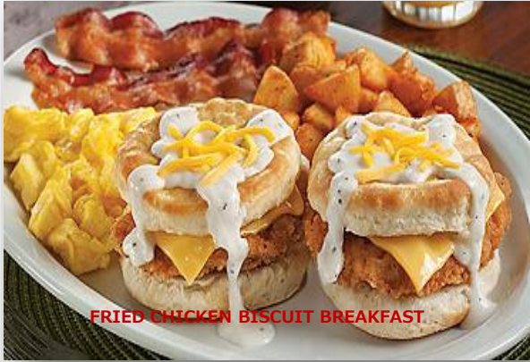
FRIED CHICKEN BISCUIT BREAKFAST

CHANGE YOUR BREAD FOR SWEET POTATO PANCAKES for $1.45 extra