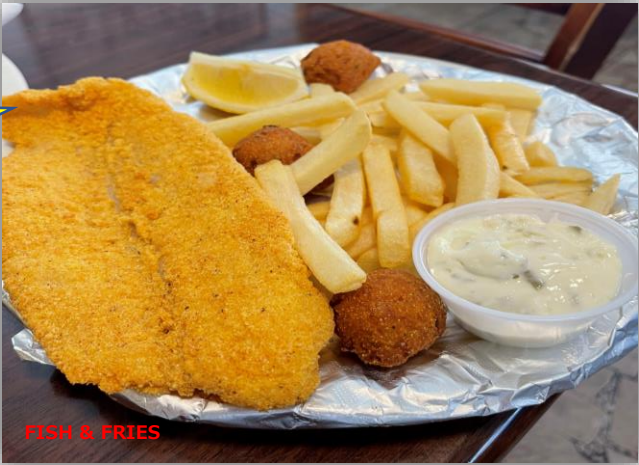
FISH & FRIES