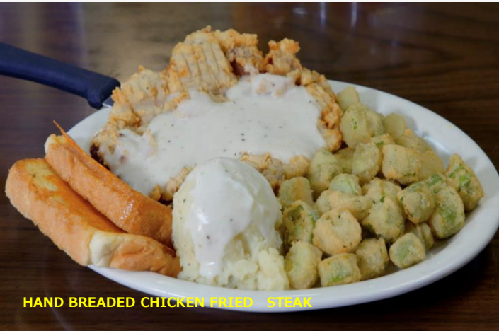
HAND BREADED CHICKEN FRIED STEAK

Tender breaded chicken strips served with 2 sides 9.99