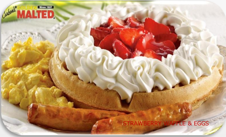
STRAWBERRY WAFFLE & EGGS