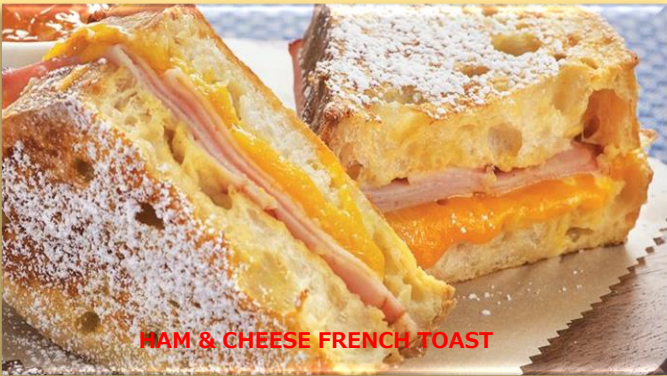
HAM & CHEESE FRENCH TOAST

2 full French toast topped with strawberries, pecans, bananas, cinnamon, powdered sugar. and whip cream. 9.49