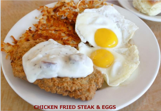
CHICKEN FRIED STEAK & EGGS

Served with two eggs, hashed browns or home fried potatoes and toast or pancakes. (4) Bacon 9.99 (2) Sausage patties 9.99 (4) Sausage links 9.99 (2) Ham 9.99