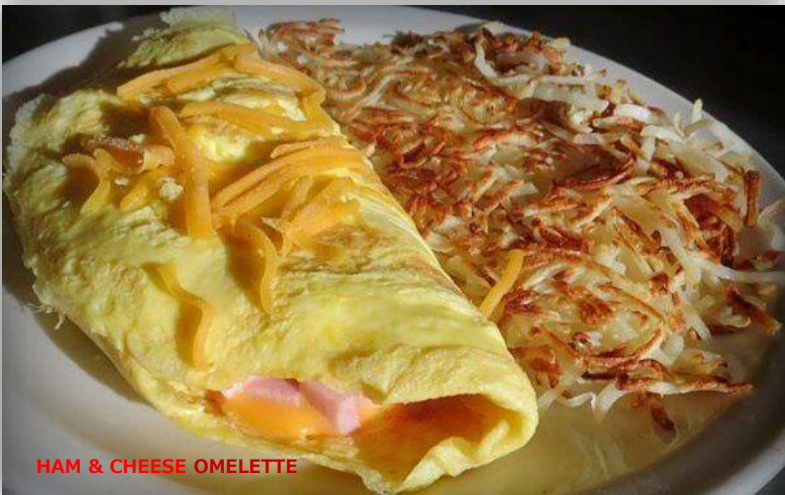
HAM & CHEESE OMELETTE

All served with choice of toast, biscuit or pancakes and breakfast potatoes. Scramblers served on a bed of breakfast potatoes... Substitute Egg white free of charge.