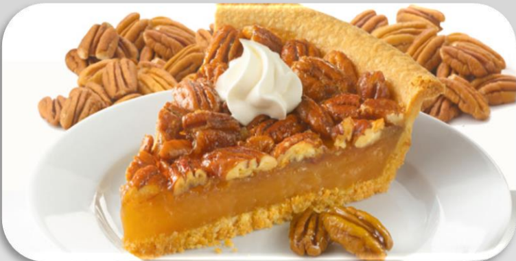
GEORGIA PECAN PIE