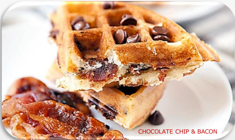
CHOCOLATE CHIP & BACON