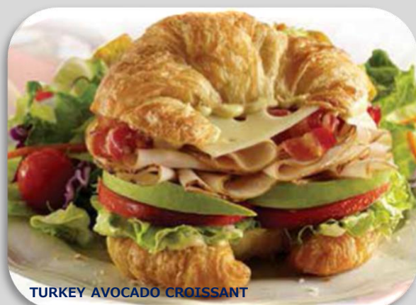
TURKEY AVOCADO CROISSANT