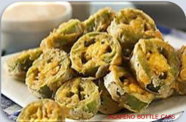
JALAPENO BOTTLE CAPS

Tender breaded chicken strips served with ranch 7.99