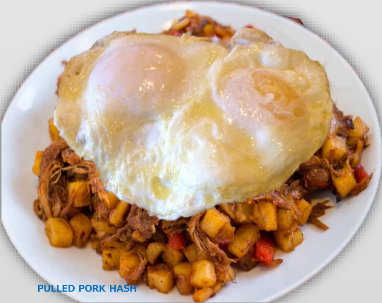
PULLED PORK HASH

Get a handle on your appetite! Diced bacon, mild green chilies, tomatoes and onion scrambled with eggs then topped with shredded cheese and sour cream. 10.99