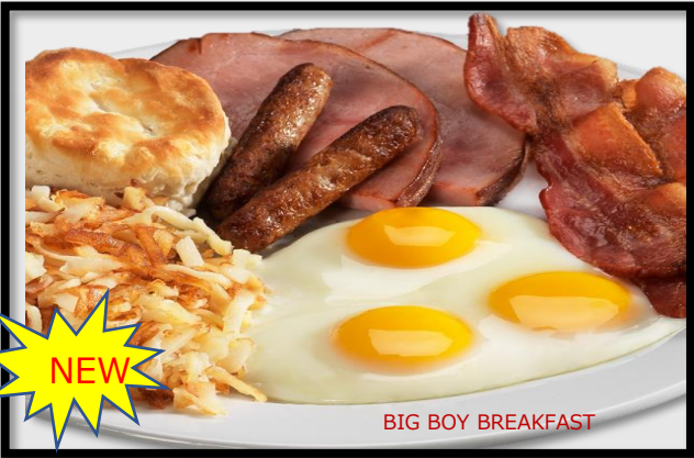
BIG BOY BREAKFAST

A juicy, tender 6 oz. seasoned USDA Choice steak and two fresh eggs cooked to order. Served with a choice of breakfast potatoes and toast or pancakes. 14.99