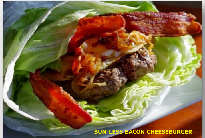
BUN-LESS BACON CHEESEBURGER

Loaded with ham, turkey, and cheese, tomato, onion and black olives on a bed of salad mix . Served with your choice of dressing. 8.99