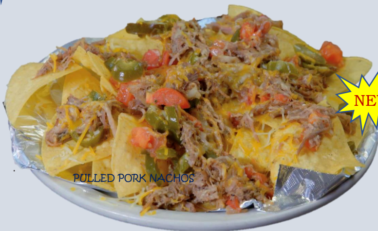
PULLED PORK NACHOS