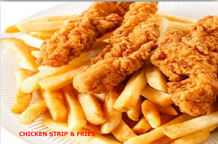
CHICKEN STRIP & FRIES